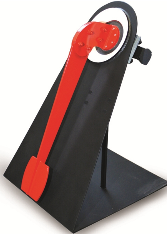
Vibrating boom (installation example)

The Stanelle vibrating boom, Type SVA serves as discharge aid for bridge-building, dry, dusty, to granulated bulk materials. The product can be mounted to rectangular hoppers or special outlets and is individual applicable which is an advantage compared to the discharge vibrating device. The subsequent installation in existing silos or hoppers can be easily accomplished. Through variable vibrating motor installation, the vibrating boom comes in various settings.